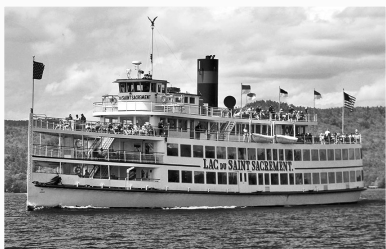
>>> The Lake George Steamboat Company, M.V. Lac Du Saint Sacrement (The Saint)