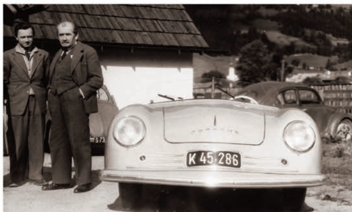
Erwin Komenda and Ferdinand Porsche with the 1948 Porsche "H1". At right the first Porsche Sales Brochure, produced in 1948.